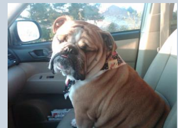
RIP Thomas The Tax Dog 2008 - 2011